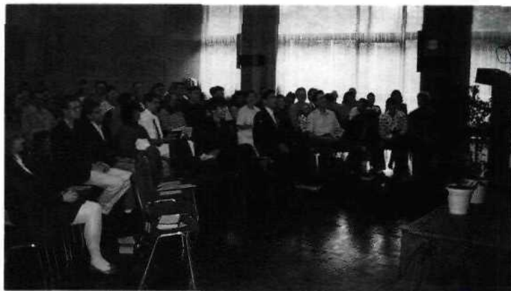
The first service in Zurich was attended by 128 people.

Please be praying for the Zurich team as they continue to form a base of disciples in Switzerland. They are full of faith, sent off by the Spirit, and determined to see Christianity restored in Switzerland not merely reformed.