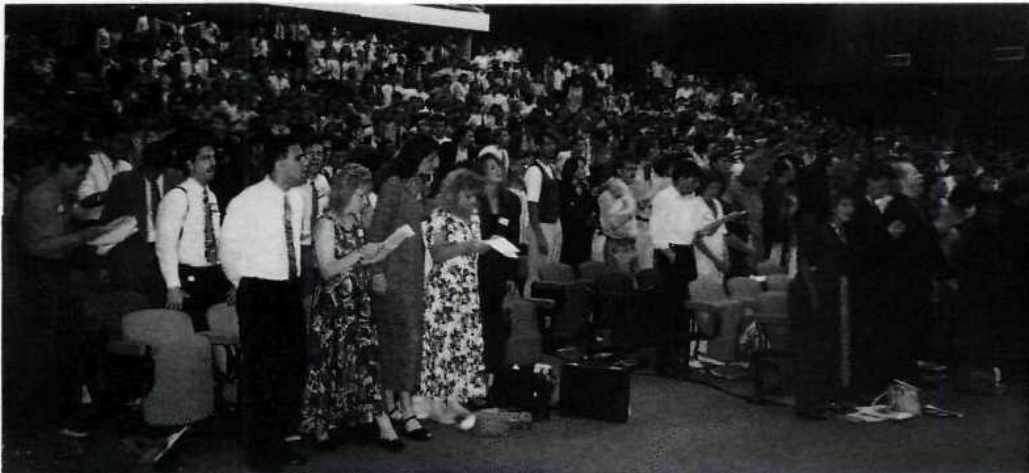
Some of the 1,000 full-time participants at the Conference representing France, Germany, Belgium, the Netherlands, Spain, Italy, Switzerland, Poland, and Hungary.