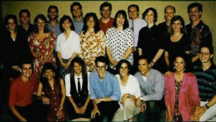
Lead couples in European churches