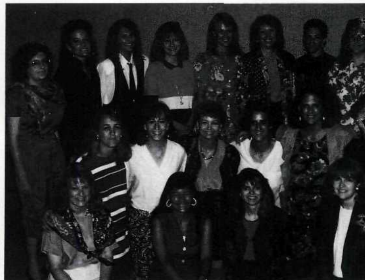
Women's ministry leaders from New England and European churches.