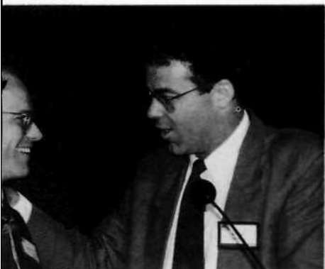
Appointed evangelist in the Milan Church of Christ