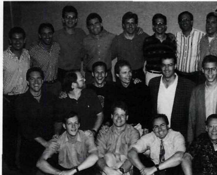
New England and European leaders along with the administrators from the churches.